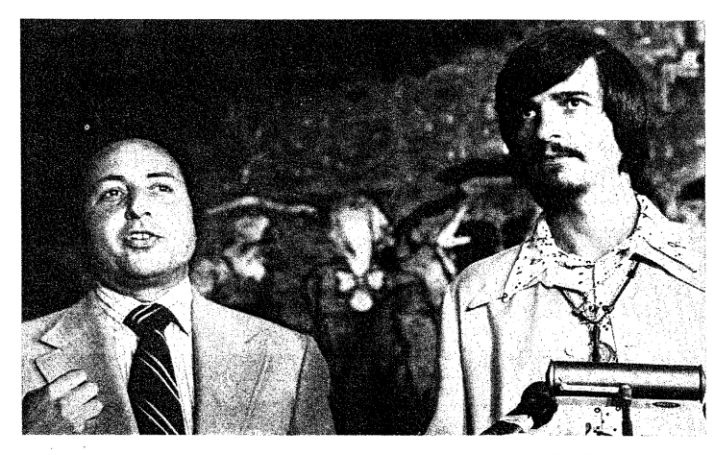
May 3. "Every great team has 5 great players; we now have one great player,"